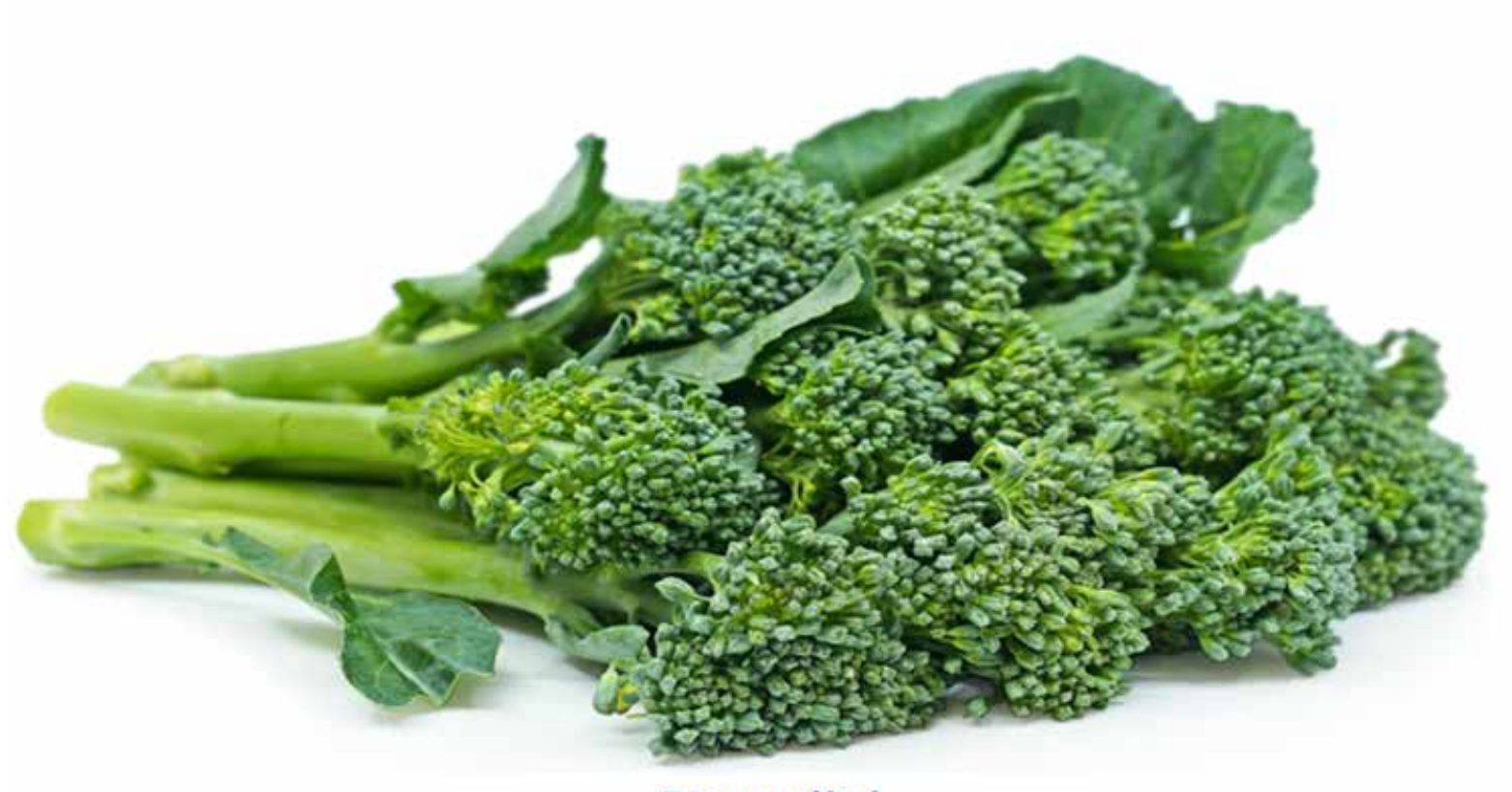
Broccolini Rich source of fibre, vitamin A, vitamin C