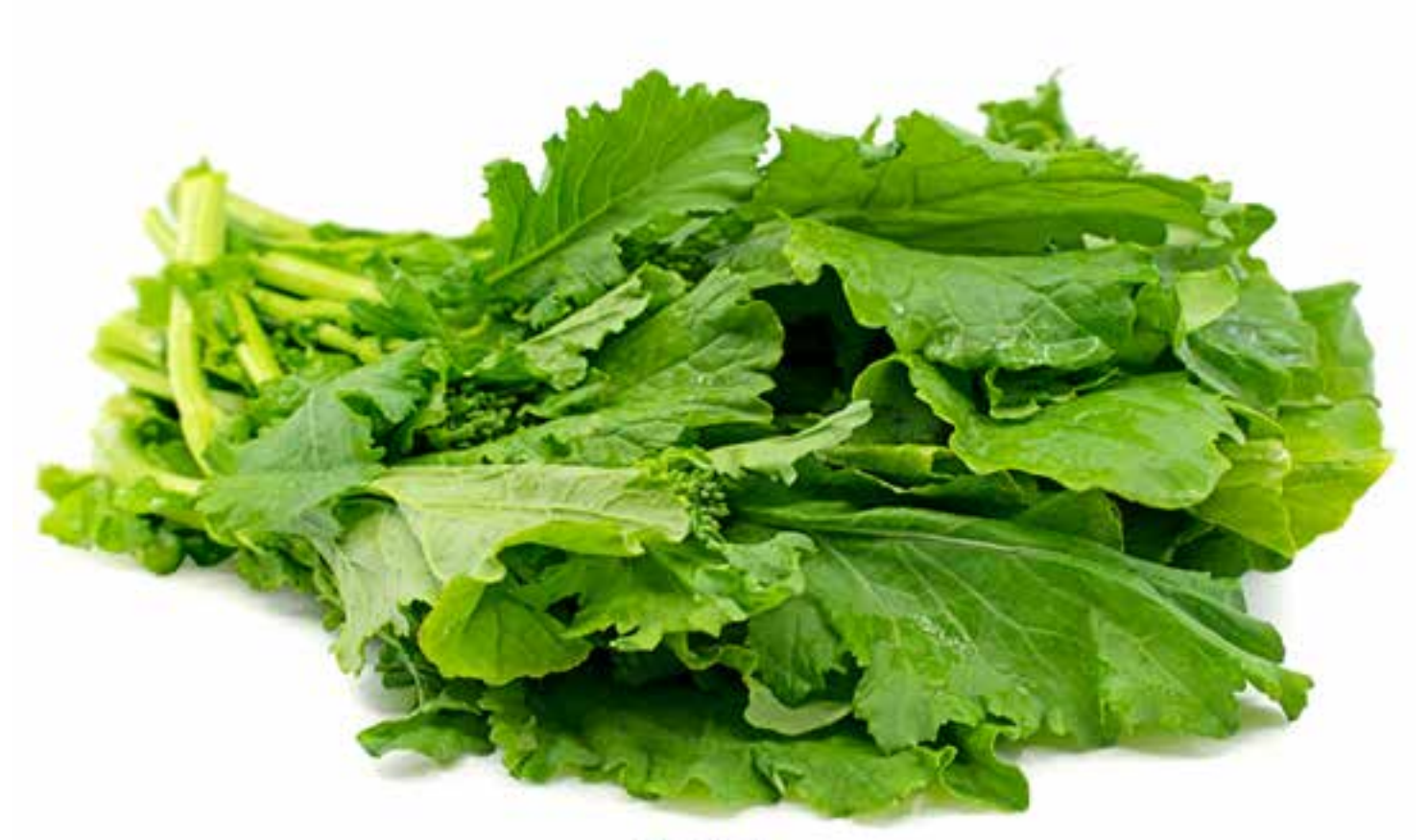
Rapini Rich source of potassium, iron, calcium, vitamin A & vitamin C